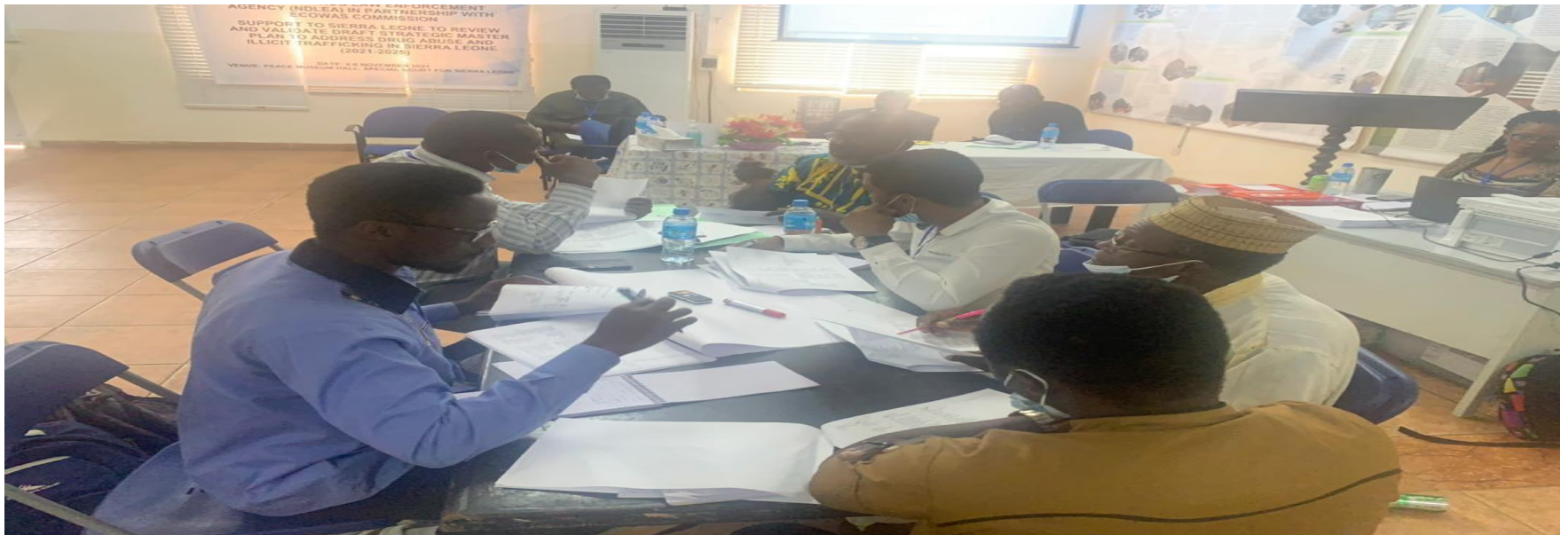
Group Session Photos at the Validation of the Strategic Master Plan