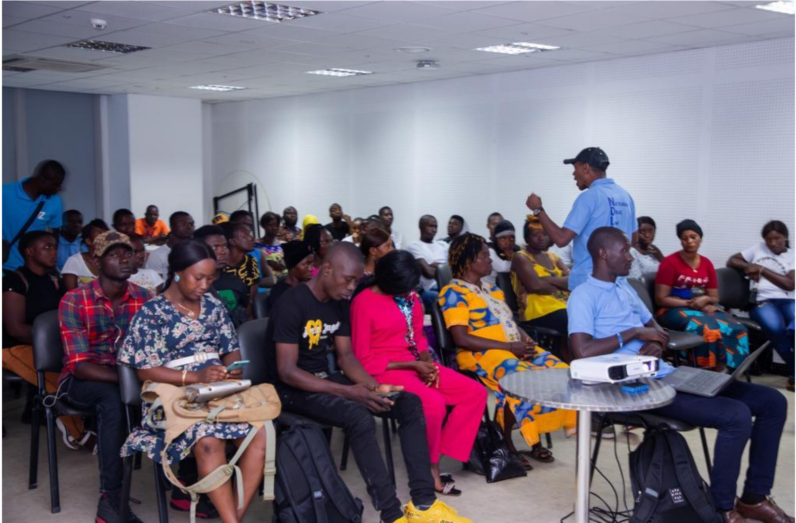
Sensitization program at the New Freetown City Council Hall of Returned Migrants in Collaboration with IOM Sierra Leone