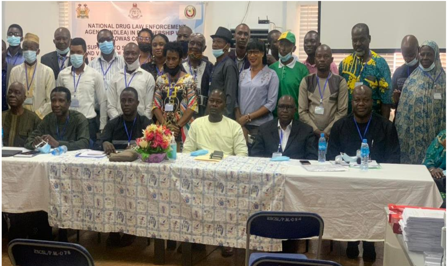
Group photo of Stakeholders and Participants at the Validation of the Strategic Master Plan to Address Substance Abuse and Illicit Drug Trafficking in Sierra Leone held at Peace Museum, Former Special Court for Sierra Leone, New England, Freetown.