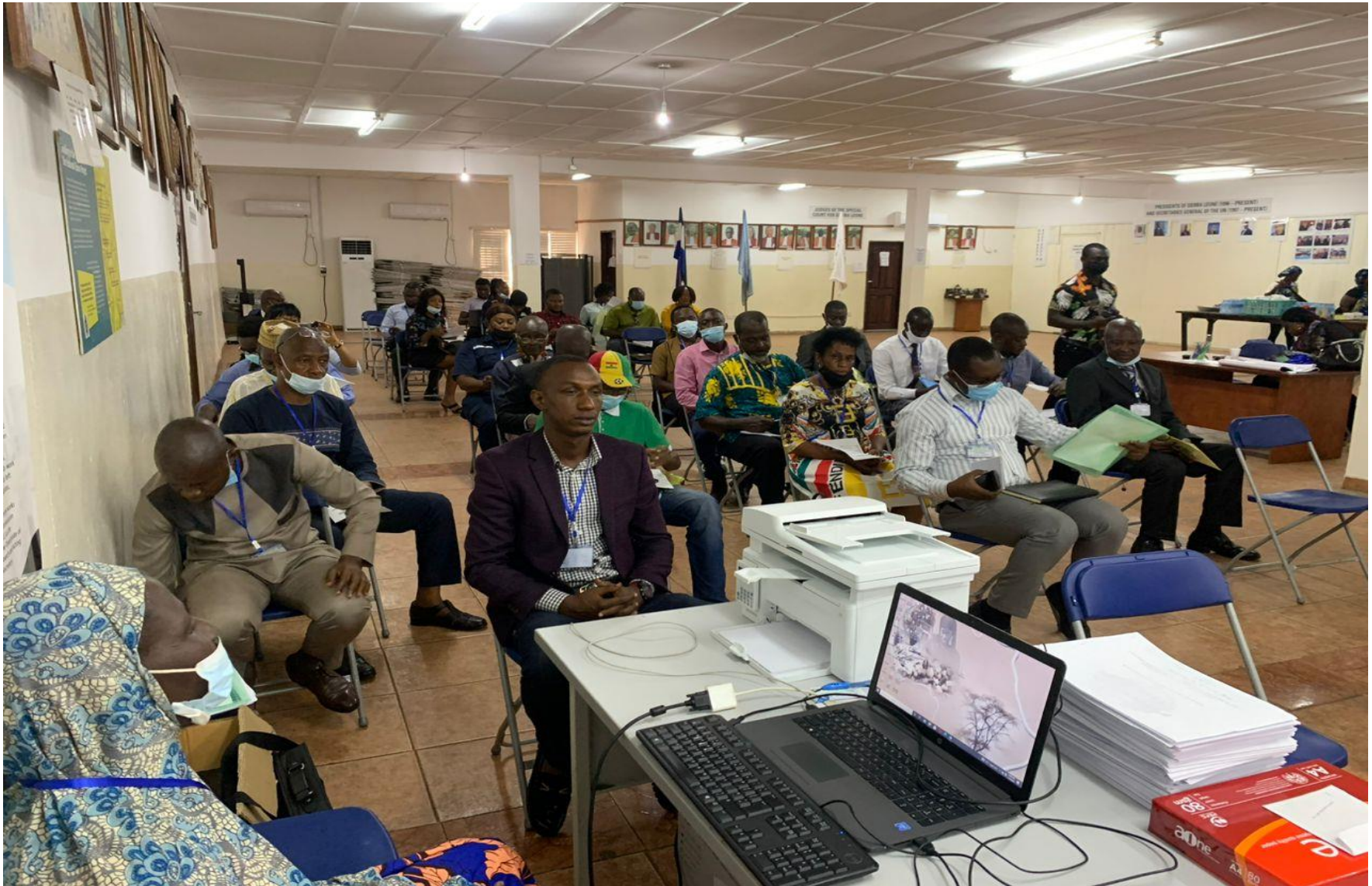
Photo of participants during the plenary session