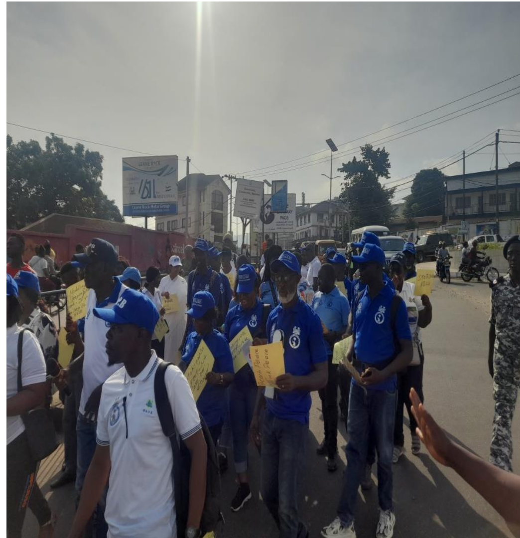
NDLEA community sensitizations in partnership with SLP Community Relations Department together with the Local Police Partnership Board (LPPB)