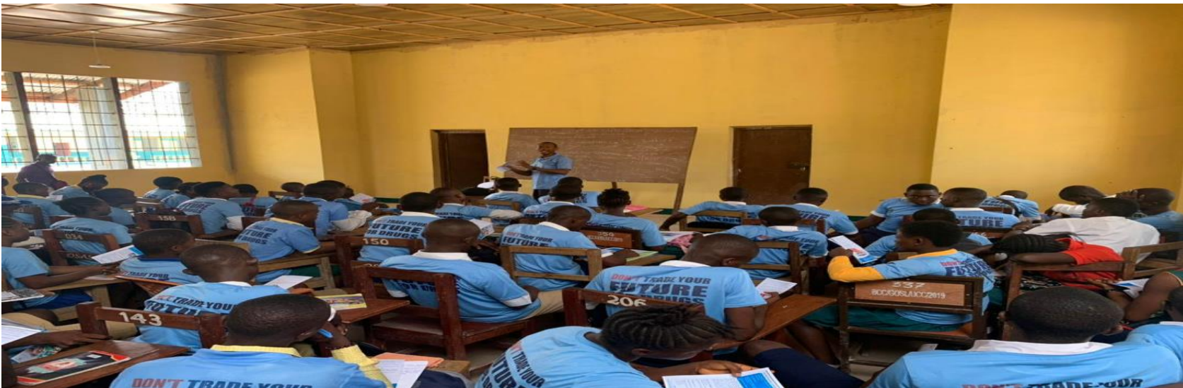
Schools Sensitization Photos