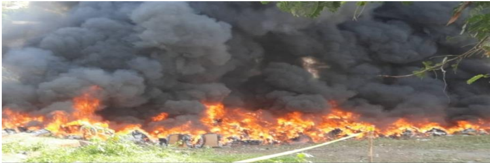
Destruction of Harmful and Prohibited Drugs at TOCU HQ, Hastings, Freetown